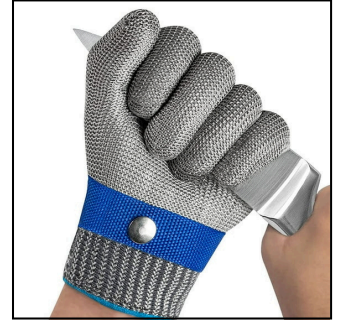
Stainless Steel Gloves