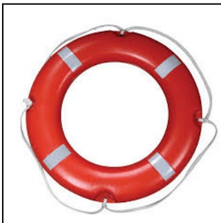
Life Buoy Ring