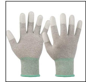
PU Coated Gloves