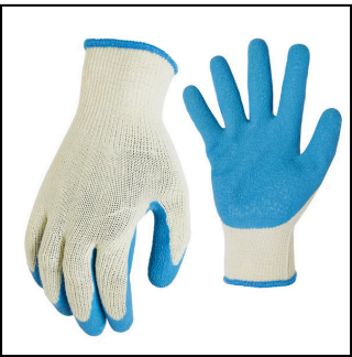
Latex Coated Gloves