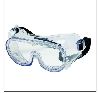
Chemical Splash Goggles