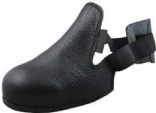
STEEL TOE GUARD