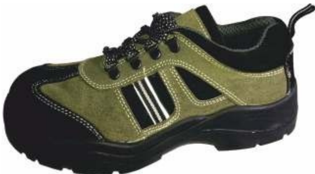
EXECUTIVE (Sporty Look)