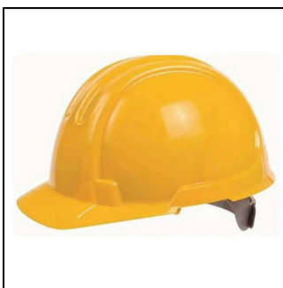
Labour Safety Helmet