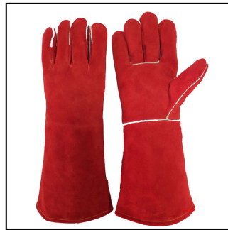
Leather Welding Hand Gloves