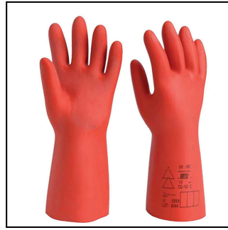
Electrical Hand Gloves