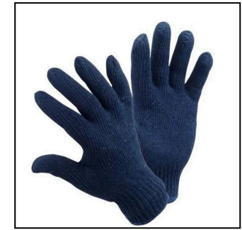
Cotton Knitted Gloves