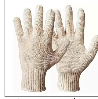
Cotton Hosiery Gloves