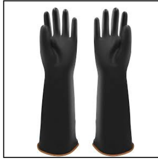
Industrial Rubber Gloves