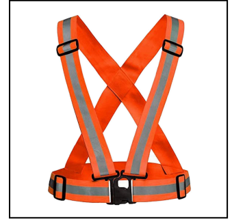
Safety Reflective Stripe Vest