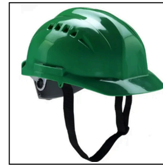
Safety Helmet with Ratchet- Staff