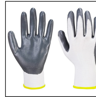
Nitrile Coated Gloves