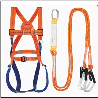
Full Body Harness with Double Scaffolding Hook