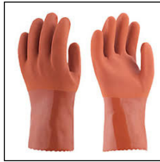
PVC Supported Gloves