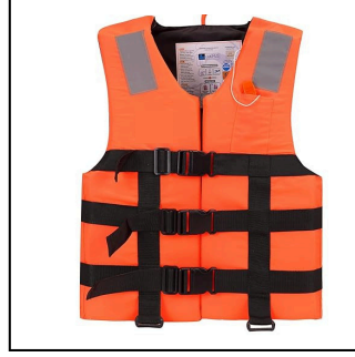
Marine life Jacket