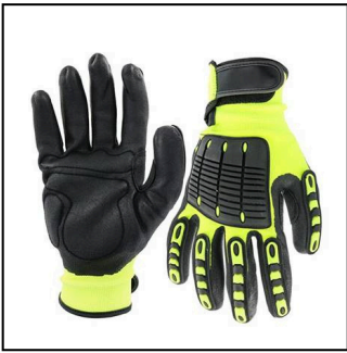
Impact Resistant Gloves