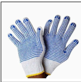
Latex Coated Gloves