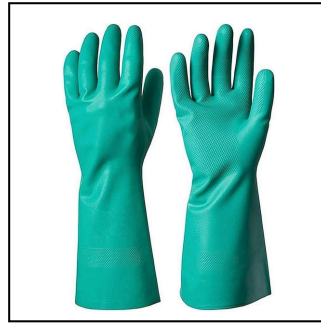
Green Nitrile Flocklined Gloves