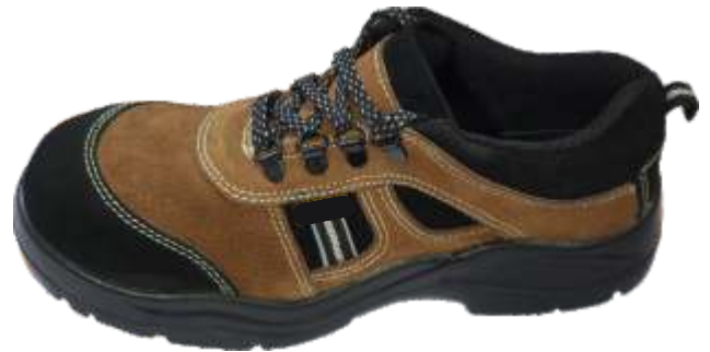
EXECUTIVE - Brown (Sporty Look)